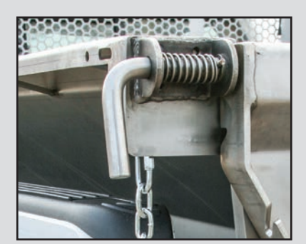
3/4" Diameter stainless steel tailgate hitch pins