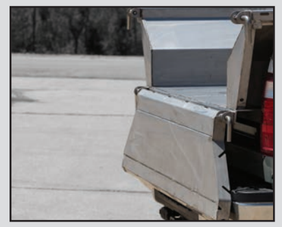
Double pivoting & removable tailgate