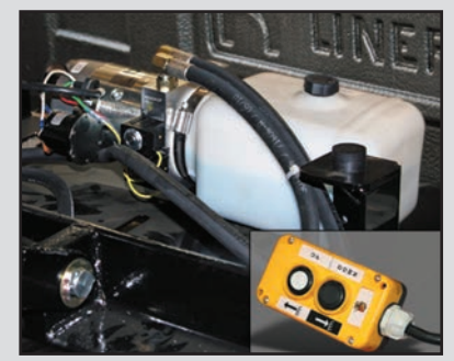
Power up & power down Monarch power unit with 10' tethered control box