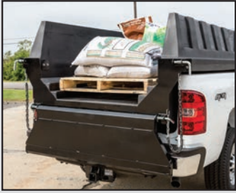
Design accommodates standard pallet

*with optional sidewall extensions sold separately