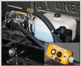
Power up & power down Monarch power unit with 10' tethered control box