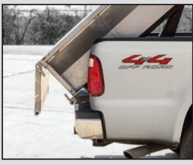
Double pivoting & removable tailgate